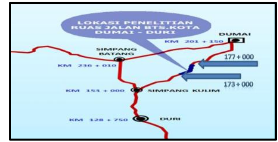
Figure 1. Map Location Research