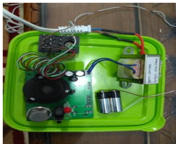
Figure 2. Initial Design of LPG Gas Leakage Detector