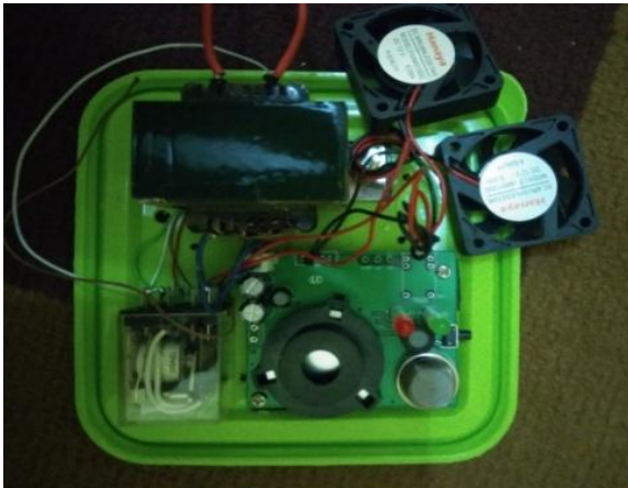
Figure 3. Initial Assembly of LPG Gas Leak Detector Equipment.