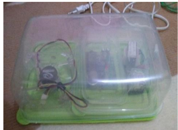
Figure 4. Component Structure in cover

The very first thing I do is do and compile the components that will be displayed on the cover, this the author did to arrange the best position for each component.