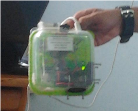
Figure 5. Green Led Lights on

This test is performed to determine whether the transformer is working properly when tested. When tested, the appliance lights up with a short buzzer marked once, followed by the LED (red and green) lights simultaneously, then the red LED light goes off. Only the green LED lights up as an indicator tool in standby condition.